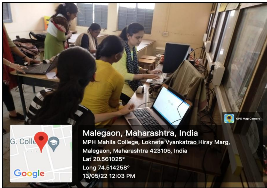
Training of Students