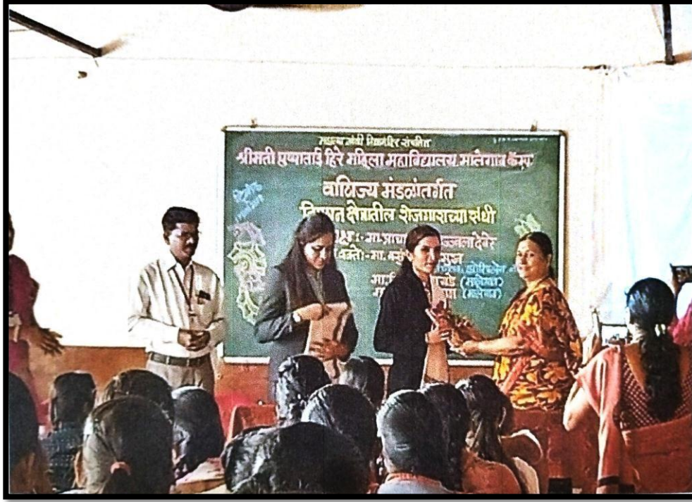
Job opportunity in Marketing Sector: Felicitation